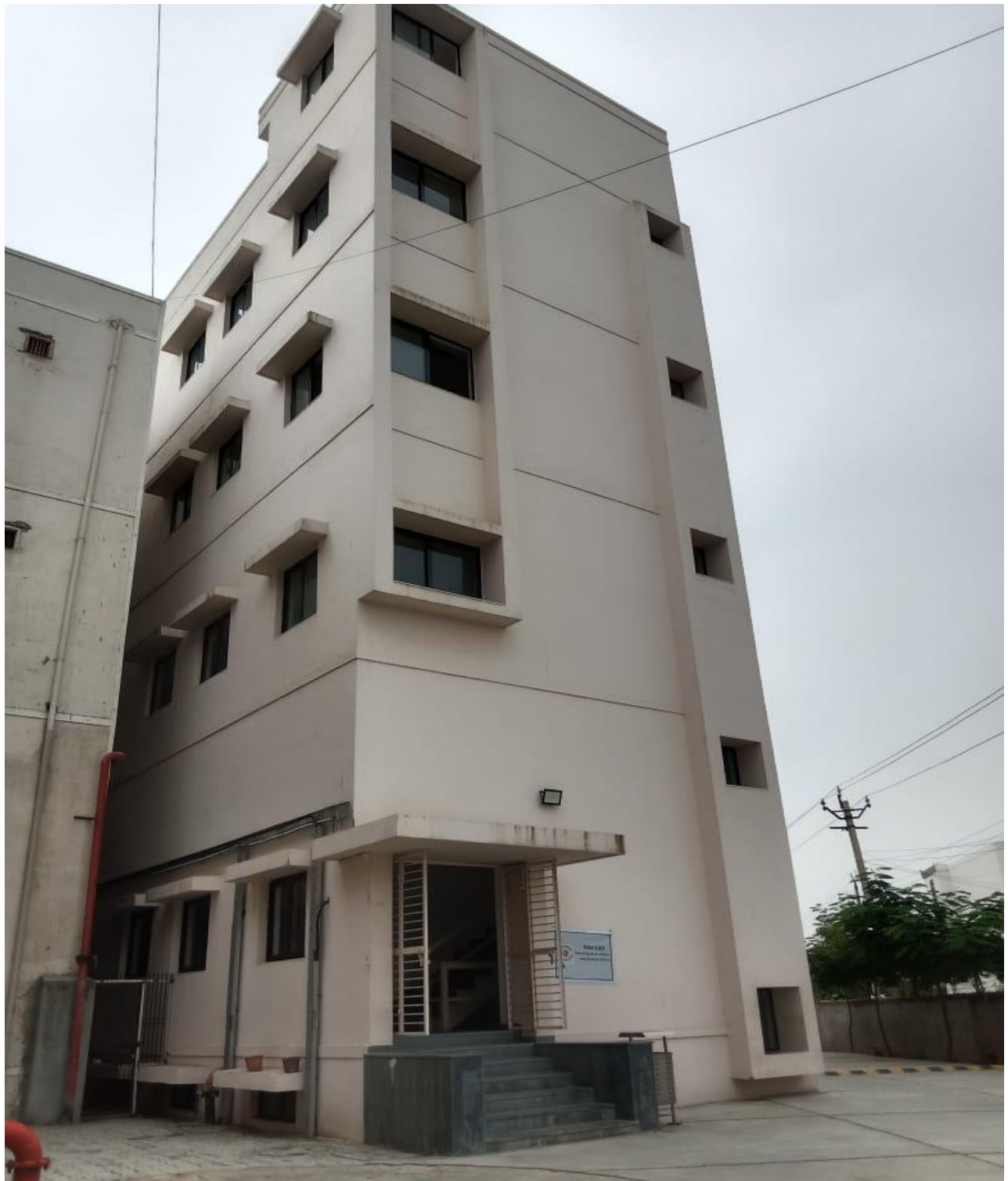
Botany & Microbiology Laboratory (new building) (RUSA grant)