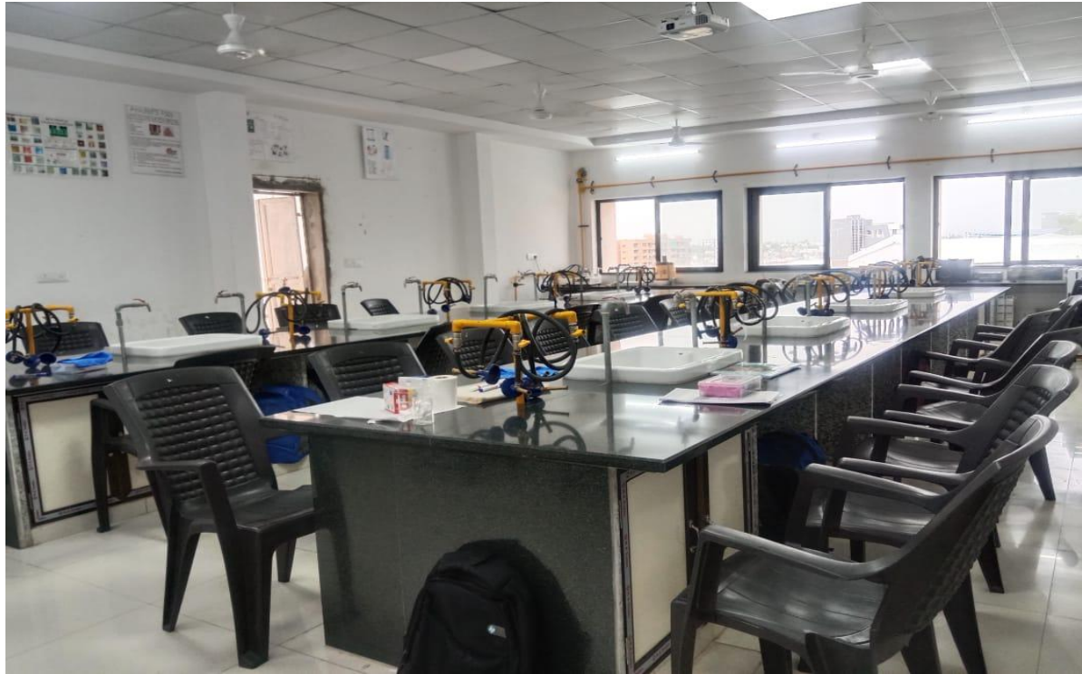
Microbiology Laboratory (Second floor in new building) (RUSA grant)