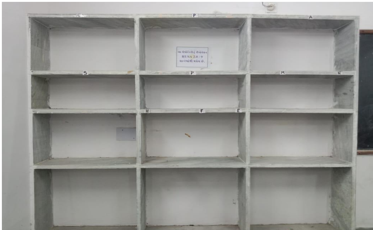
Botany Museum Laboratory(RUSA grant)