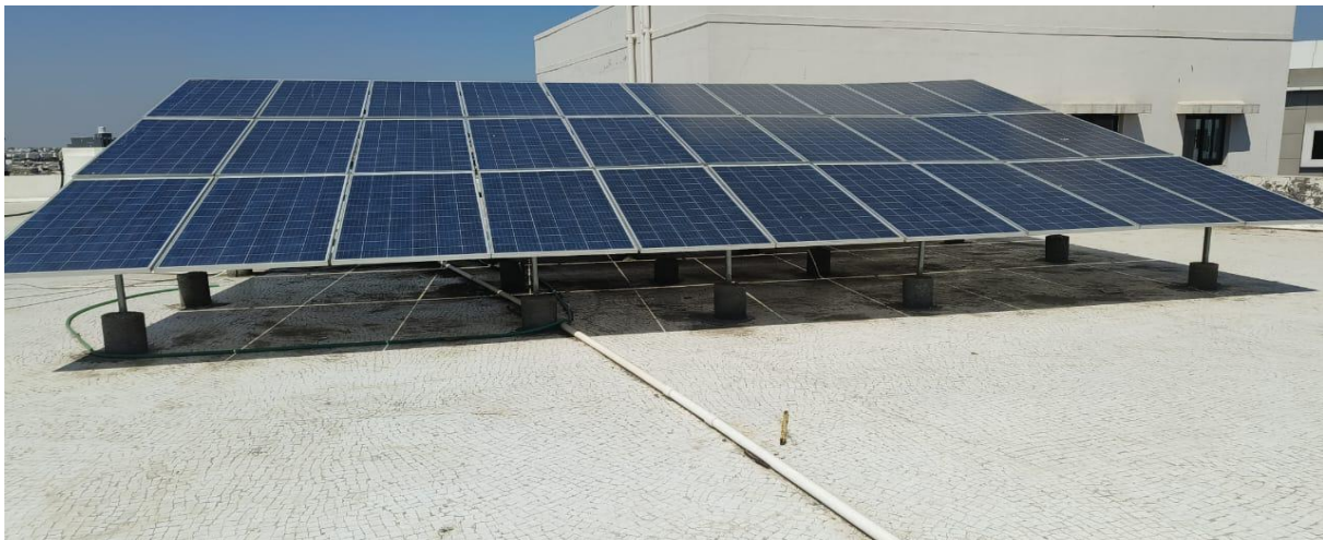
(On the roof of building of RR Mehta College of Science and CL Parikh College of Commerce, Palanpur) (RUSA grant) (Roof top solar panel)