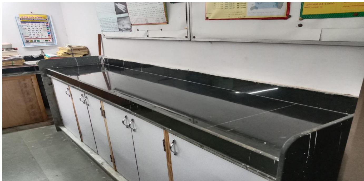
Physics Department H.O.D. Office Platform (RUSA grant)