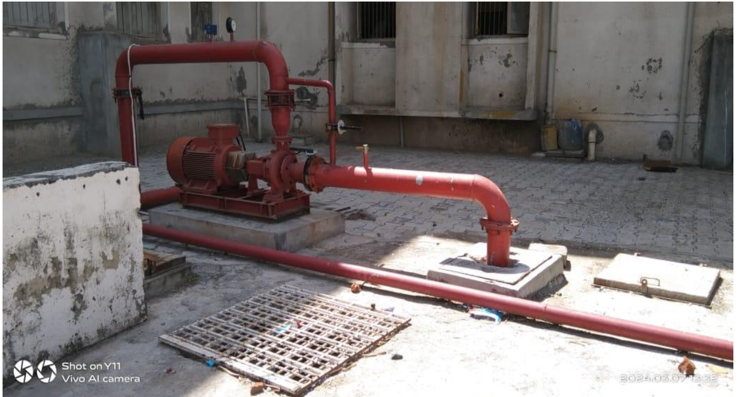
Rain water harvesting (RUSA grant)