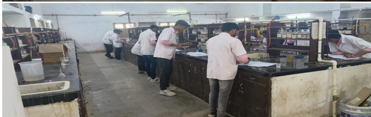
(Chemistry Lab Renovation from RUSA grant)